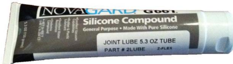
Part ID 2LUBE

*Note: The number of joints per 5.3oz tube is an approximation only