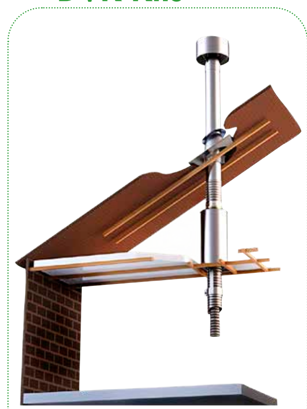
Typical Vertical Installation: 2DVK-VX