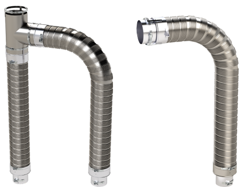
Multiple Appliance B-Vent Single Appliance B-Vent

*All images are for illustrative purposes only. Please refer to guide for specific U.L. installation instructions. Always defer to local building codes.